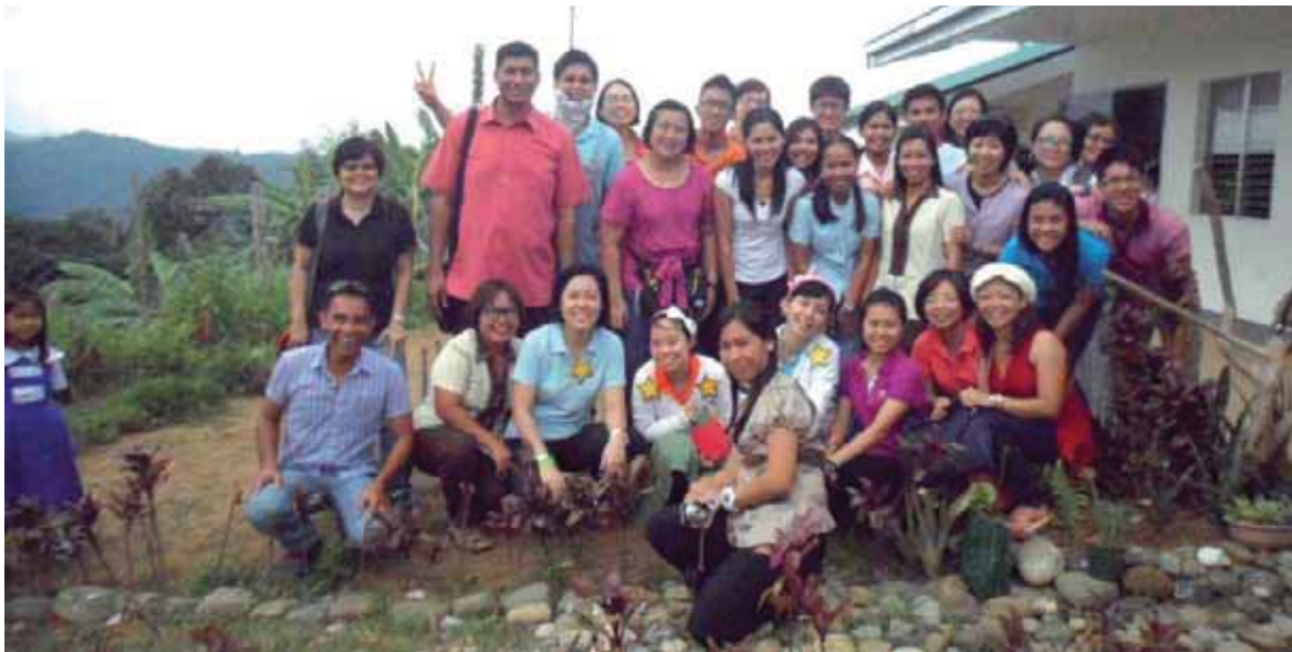
A team of 17 Trinitarians from the AlphaTrack program brought relief packs to two devastated areas in Northern Iloilo.

From Nov 25 to Dec 2, a Missions Impact Team (MIT) comprising 17 AlphaTrackers brought a total of 1,000 relief packs sponsored by Trinity and our partner organization to families in the towns of Sara and Concepcion.