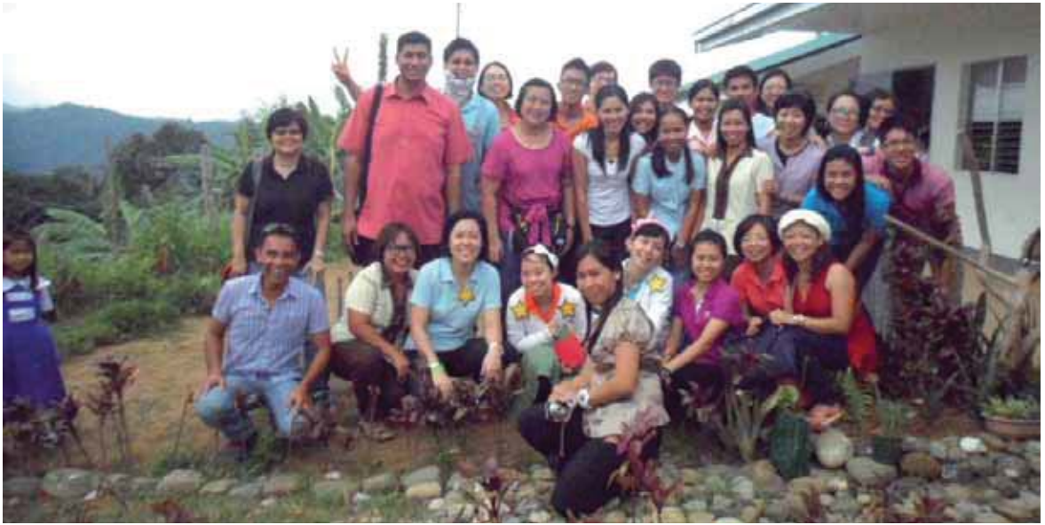
A team of 17 Trinitarians from the AlphaTrack program brought relief packs to two devastated areas in Northern Iloilo.

From Nov 25 to Dec 2, a Missions Impact Team (MIT) comprising 17 AlphaTrackers brought a total of 1,000 relief packs sponsored by Trinity and our partner organization to families in the towns of Sara and Concepcion.